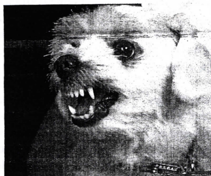
Looking away or flicking the tongue is intended to calm a frightening individual. Baring the teeth is the next step.